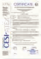
CESI type certificate