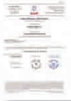
BV type certificate