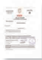
BV Mode 1 Survey Scheme