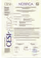
CESI product quality assurance