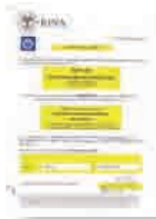
RINA Scheme 2 electrical motors and drives up to 100 kW